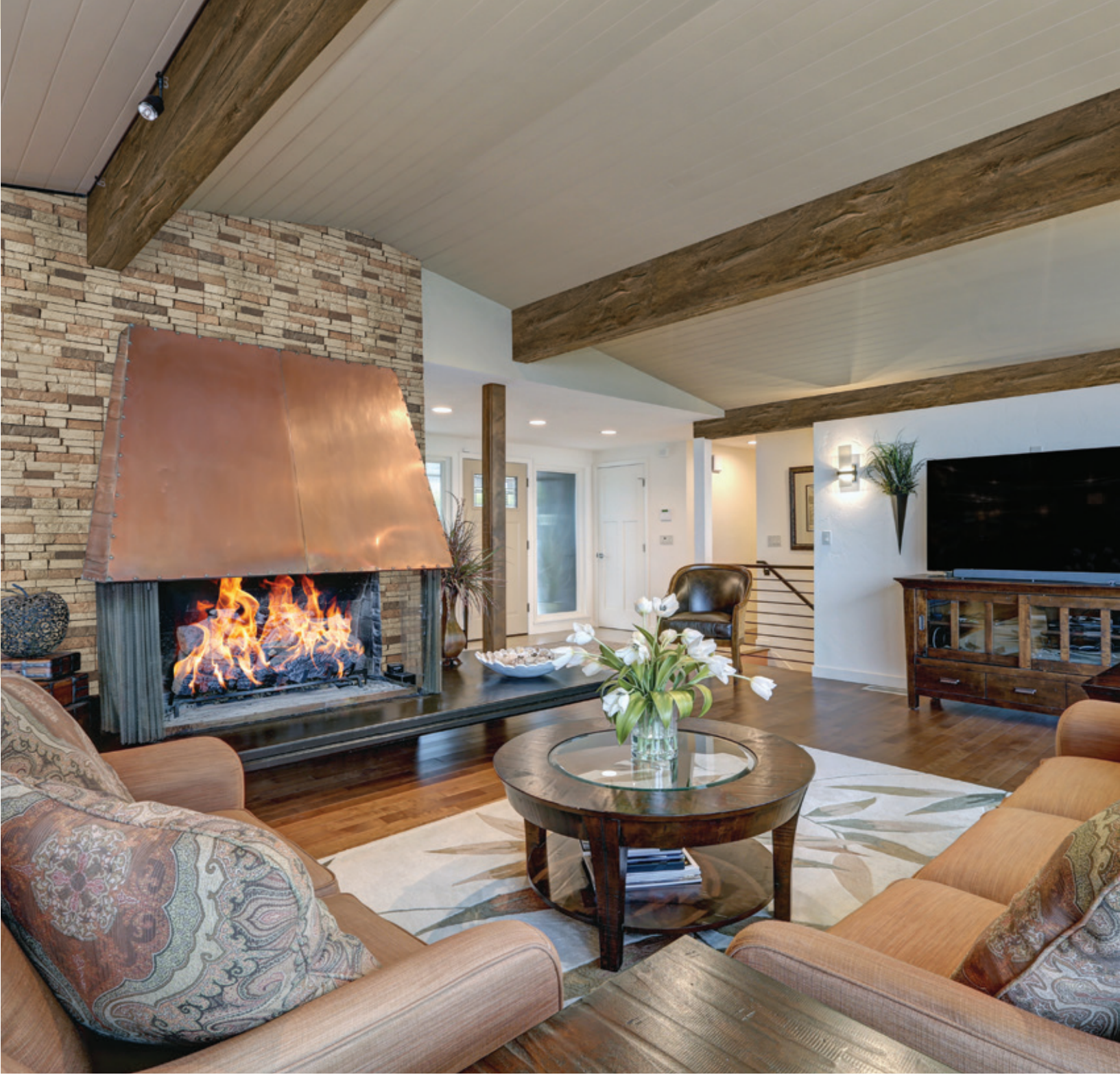
TIMBER BEAMS SHOWN IN CINNAMON