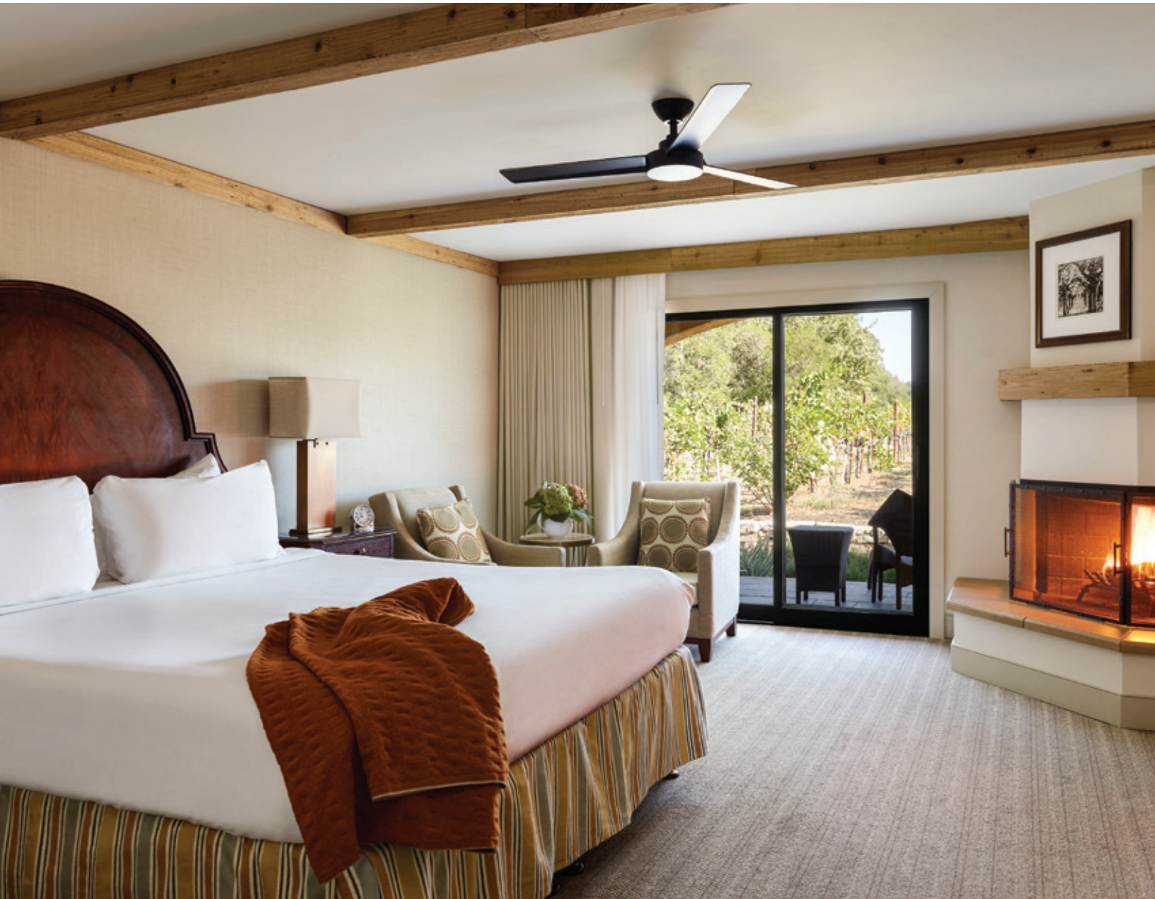
BARN BOARD BEAMS AND PLANKS SHOWN IN WARM NATURAL

SIZE: 4 IN-18 IN W & H WITH SEAM AT 15 IN | UP TO 48 FT L WITH JOINTS EVERY 15 FT SHAPE: STRAIGHT CONSTRUCTION: 4-SIDED | 3-SIDED | 2-SIDED/L-HEADER | PLANKS | MANTELS