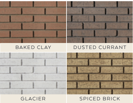
BAKED CLAY DUSTED CURRANT GLACIER SPICED BRICK