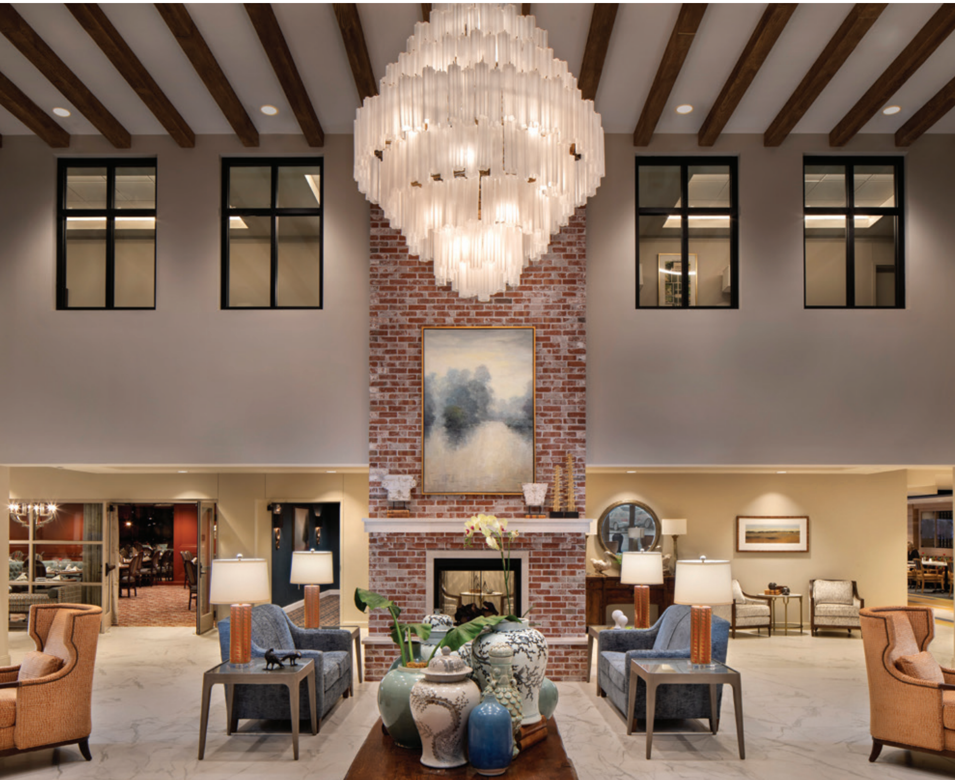
▲ BEACHWOOD BEAMS SHOWN IN CARAMEL