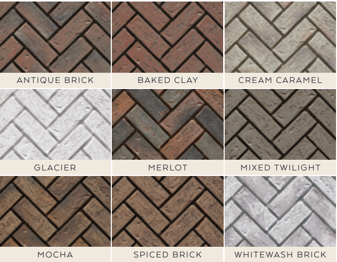
ANTIQUE BRICK BAKED CLAY CREAM CARAMEL GLACIER MERLOT MIXED TWILIGHT MOCHA SPICED BRICK WHITEWASH BRICK