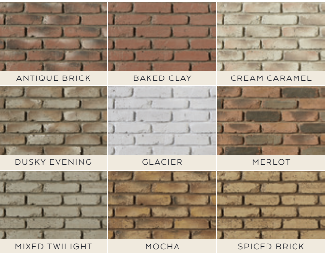
ANTIQUE BRICK BAKED CLAY CREAM CARAMEL DUSKY EVENING GLACIER MERLOT MIXED TWILIGHT MOCHA SPICED BRICK