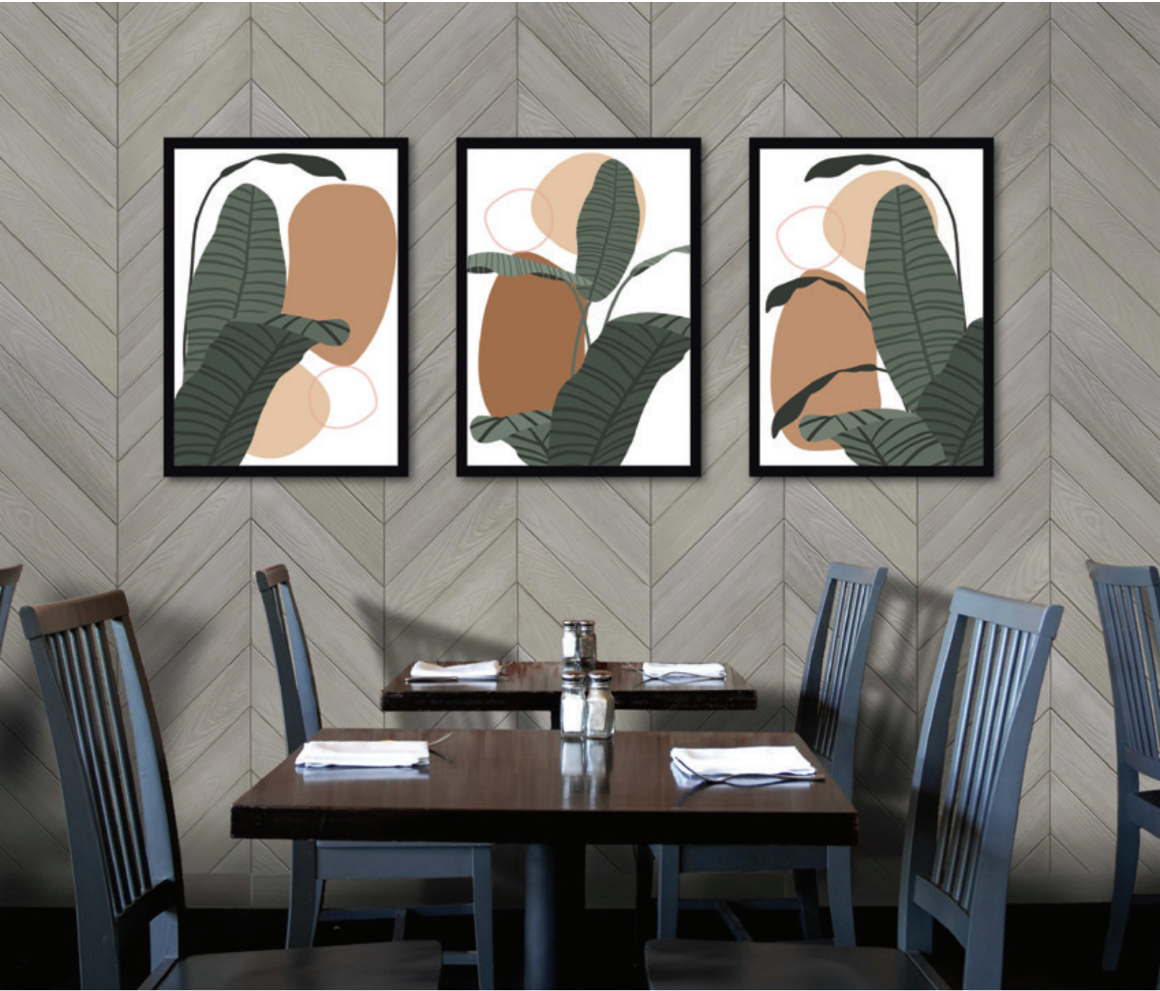
CHEVRON PANELS SHOWN IN FOSSIL GRAY

Discover the natural look of wood that provides a warm yet rustic touch to any design. View the entire collection at barrondesigns.com/wood .