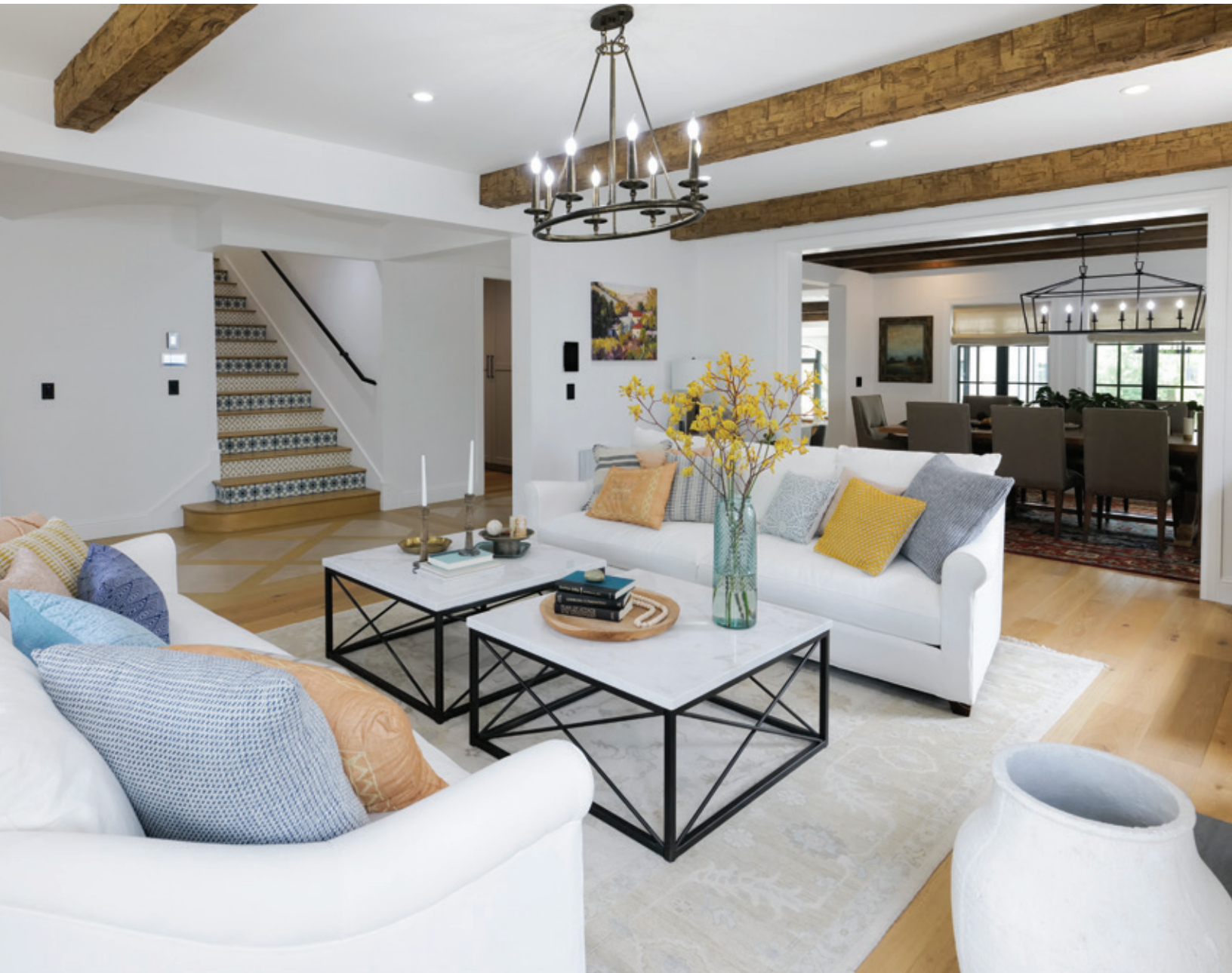
ROUGH HEWN BEAMS SHOWN IN CARAMEL

SIZE: 4 IN-36 IN W & H | UP TO 30 FT L SHAPE: STRAIGHT | ARCHED CONSTRUCTION: 4-SIDED | 3-SIDED | 2-SIDED/L-HEADER | PLANKS | MANTELS